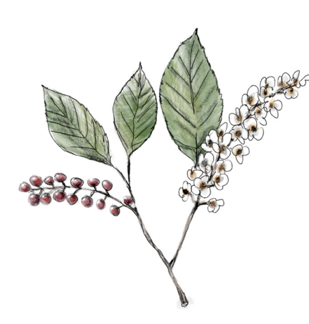
Chokecherry (Prunus virginiana) Grows 20'-25' tall