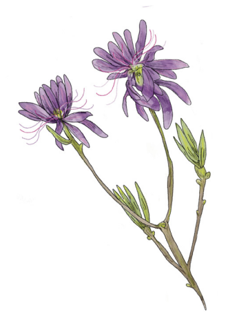
Rhodora (Rhododendron canadense) Grows 1'-3' tall