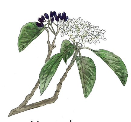
Nannyberry (Viburnum lentago) Grows 15'-20' tall