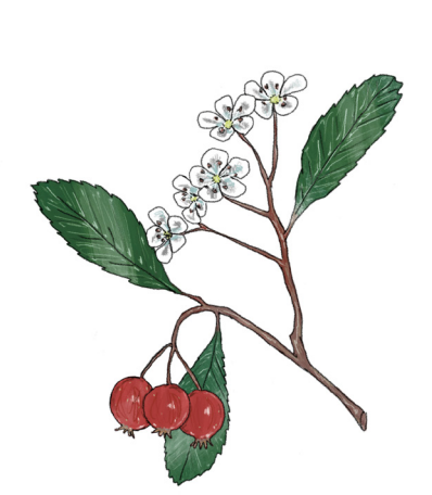
Cockspur Thorn or Cockspur Hawthorn (Crataegus crus-galli) Grows 25'-30' tall