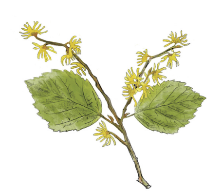
Common Witchhazel (Hamamelis virginiana) Grows 20'-30' tall