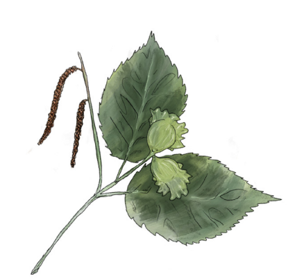
American Hazelnut (Corylus americana) Grows 8'-10' tall