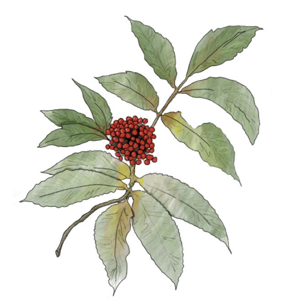
Scarlet Elder (Sambucus racemosa) Grows 15'-20' tall