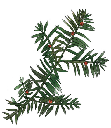
Canadian Yew (Taxus canadensis) Grows 2'-3' tall