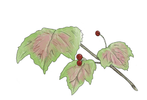
Highbush Cranberry (Viburnum trilobum) Grows 10'-12' tall