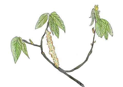
American Hornbeam (Carpinus caroliniana) Grows 25'-30' tall