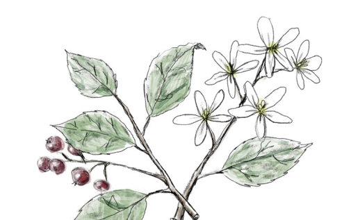
Eastern Serviceberry (Amelanchier canadensis) Grows 25'-30' tall