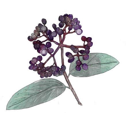
Wild Raisin (Viburnum cassinoides) Grows 6'-10' tall