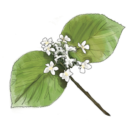
Hobblebush (Viburnum lantanoides) Grows 5'-10' tall