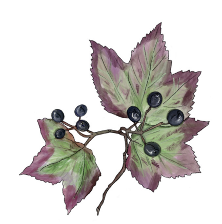
Mapleleaf Virburnum (Viburnum acerifolium) Grows 3'-6' tall