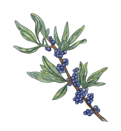
Northern Bayberry (Myrica pennsylvanica) Grows 5'-10' tall