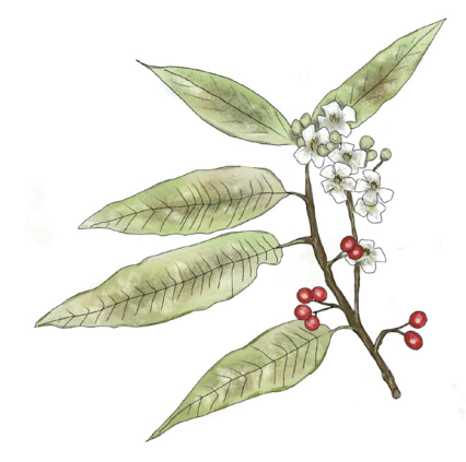
Pin Cherry (Prunus pensylvanica) Grows 25'-30' tall