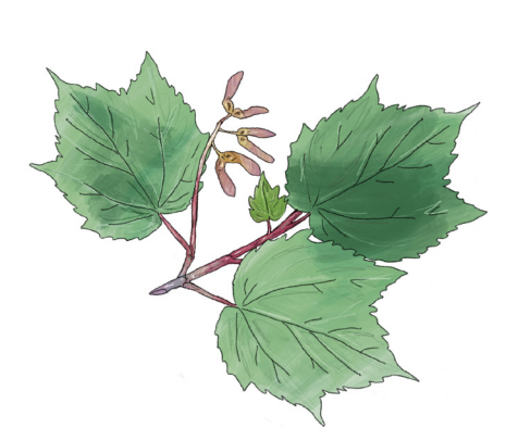
Mountain Maple (Acer spicatum) Grows 25'-30' tall