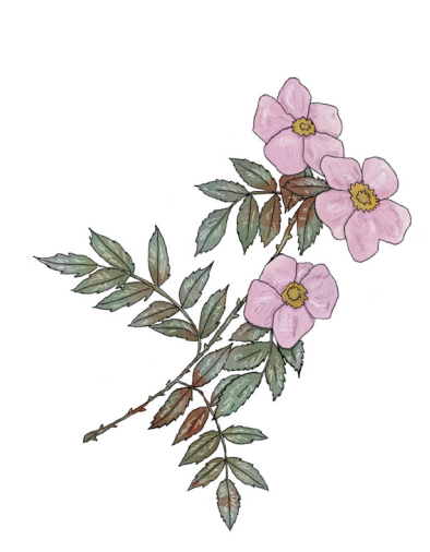
Wild Rose (Rosa virginia) Grows 2'-6' tall