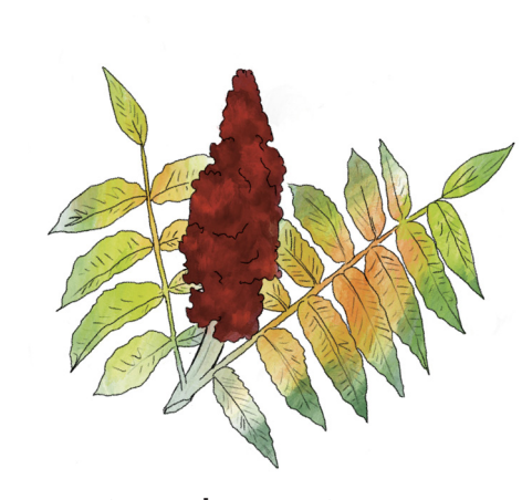
Staghorn Sumac (Rhus typhina) Grows 15'-20' tall