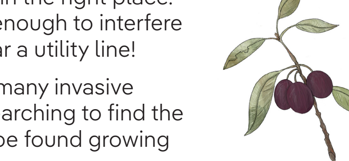
Beach Plum (Prunus maritima) Grows 6'-8' tall

Not only are these plants great for all of Maine's wildlife, but they are also fantastic alternatives to many invasive ornamental plants. While we did our best to highlight some of our favorite species, we recommend researching to find the right plant for you, your home, and your landscaping goals. Many of the species recognized here can be found growing naturally along our transmission corridors.