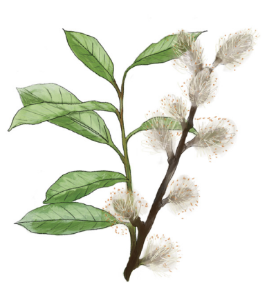
Pussy Willow (Salix discolor) Grows 25'-30' tall