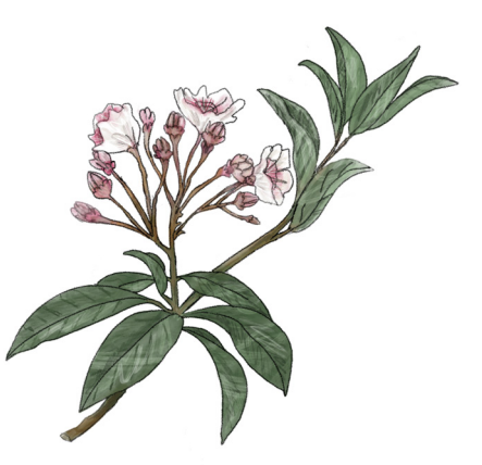
Sheep Laurel (Kalmia angustifolia) Grows 2'-3' tall