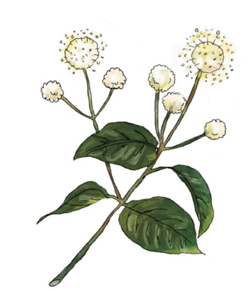
Common Buttonbush (Cephalanthus occidentalis) Grows 6'-10' tall