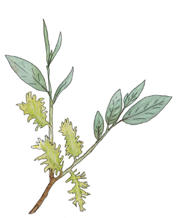
Spicebush (Lindera benzoin) Grows 3'-12' tall