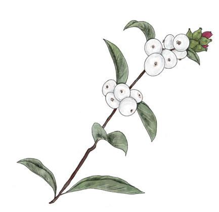
Common Snowberry (Symphoricarpos albus) Grows 3'-6' tall