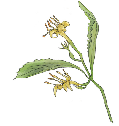
Northern Bush Honeysuckle (Diervilla lonicera) Grows 1'-4' tall