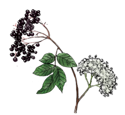
Common Elderberry (Sambucus canadensis) Grows 6'-13' tall