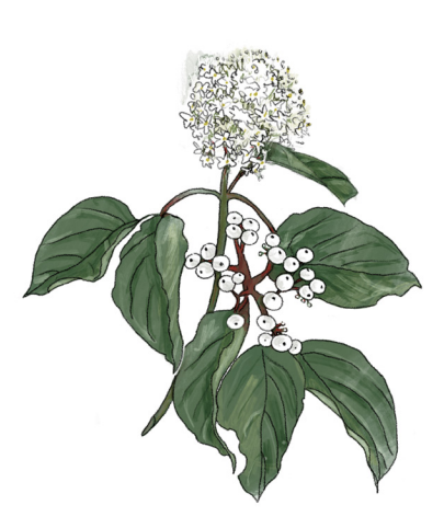
Gray Dogwood (Cornus racemosa) Grows 10'-12' tall