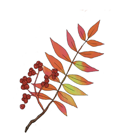
American Mountain-ash (Sorbus americana) Grows 15'-30' tall