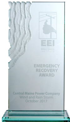
Emergency Recovery Award

We will continue to be focused on our customers and work hard every day to provide safe, reliable electricity delivery service —no matter what the weather!