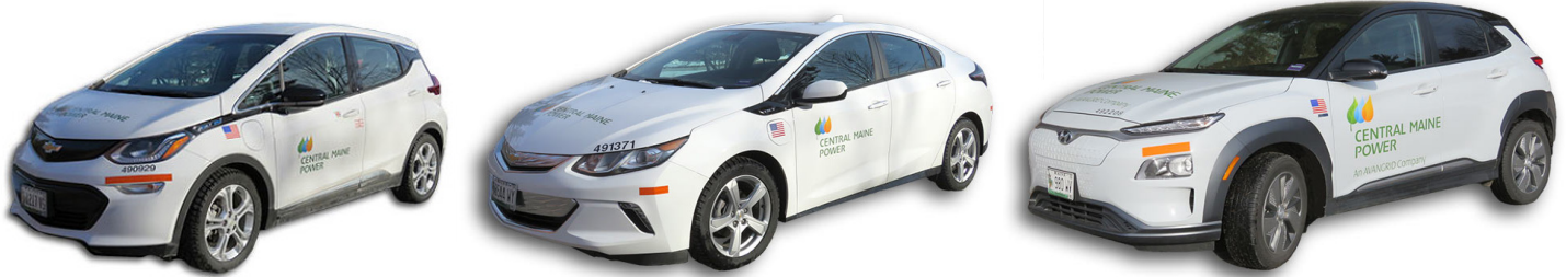
Lowering our carbon footprint with electric vehicles. Shown here: Chevy Bolt, Chevy Volt and Hyundai Kona.

Visit cmpco.com and click on Plug-in Electric Vehicles in the Smart Energy tab where you'll find additional information to determine if a Plug-in electric vehicle is right for you. Efficiency Maine Trust provides a rebate program on qualifying electric vehicles. See if the vehicle you're interested in qualifies by visiting efficiencymaine.com/ev .