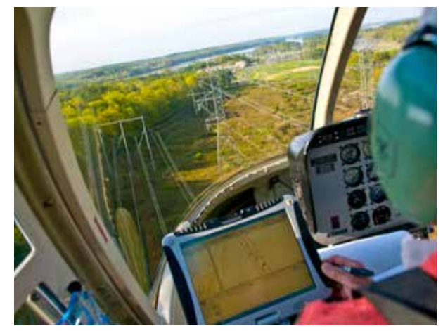
Helicopter inspection along one of CMP's transmission line corridors.

Visit cmpco.com to learn more about reliable service for you.