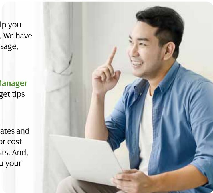
Our FREE tools can help you understand and manage your energy use.

Sign up for FREE Usage Alerts to receive energy use updates and receive an alert if you exceed a certain amount of usage or cost so you can make changes to help reduce your energy costs. And, you can text us anytime once enrolled and we will tell you your monthly usage instantly!