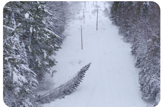
Jim Wright, Supervisor, Transmission Operations and Maintenance, holds the drone that located a fallen tree on a remote stretch of our transmission line during a storm last winter near Skowhegan.