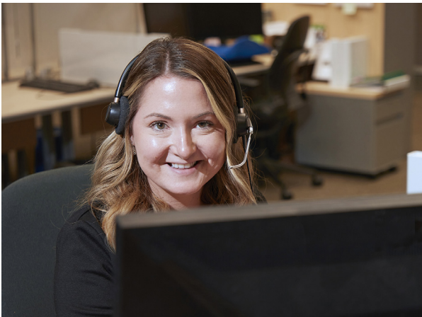
Our Customer Care team is ready to help.