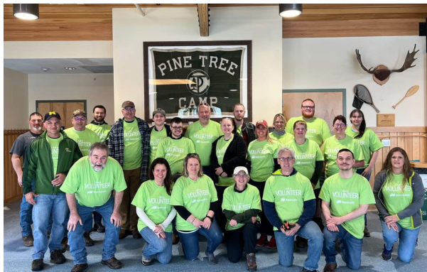
CMP volunteers spent a clean-up day at Pine Tree Camp to help the organization prepare for its summer camp session.

Visit cmpco.com/MyAccount and get started today!