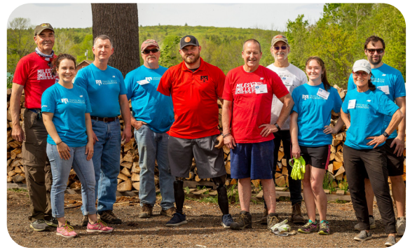
CMP employees supported the Travis Mills Foundation at their headquarters in Rome, Maine this summer.

To help the foundation prepare for opening day this year, dozens of our employees volunteered and assisted with cutting and stacking wood, weeding gardens and painting. We're proud to support the Travis Mills Foundation and other community service programs with one goal in mind: to care for the people we serve.