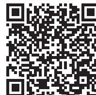
Scan this QR code to bring you to our Mobile App in Google Play