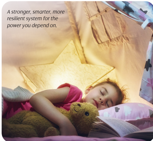
A stronger, smarter, more resilient system for the power you depend on.

For example, we recently completed work on a new substation on Main Street in East Wilton. This new substation replaces a more than 50-year-old facility on Temple Road in Wilton.