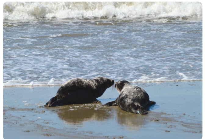
Breaker and an unnamed rescued MMOME seal are released back into the ocean in Phippsburg, ME.

MMOME is a nonprofit 501(c)3 charitable organization that provides veterinary services, assistance, and care to stranded marine animals in Maine's southern and midcoastal areas.