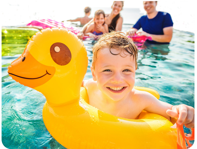
Relax and stay cool this summer with Energy Manager.

Go to cmpco.com/EnergyManager to sign up for this free tool.