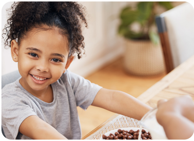
Your eBill signup that contributed to our $5,000 donation to Good Shepherd Food Bank will provide enough food for 10,000 meals!