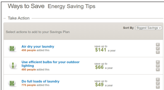
Get energy saving tips that show you an estimate of how much money you can save per year.

Visit cmpco.com/EnergyManager to learn more and to sign up for this free tool.