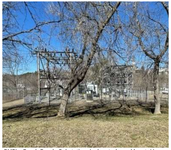
CMP's Bond Brook Substation is located on Mount Vernon Avenue in Augusta.

Work activity periods will comply with town ordinances. Typical construction noise will occur. Abutters may hear heavy equipment (bucket trucks, cranes, and excavators) during construction activities.